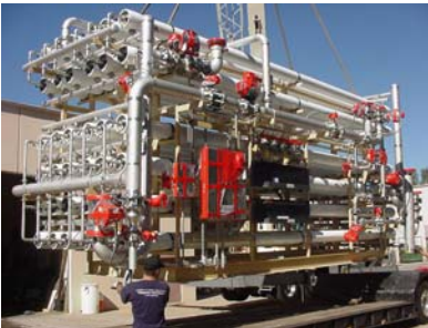
Double-pass Reverse Osmosis System