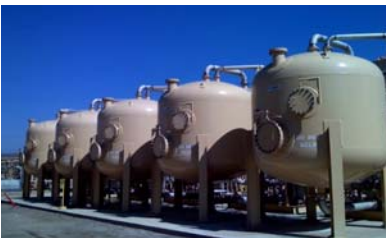
High-rate Downflow Multimedia Filters

N.A. Water Systems, LLC water.info@veoliawater.com www.nawatersystems.com 800-337-0777